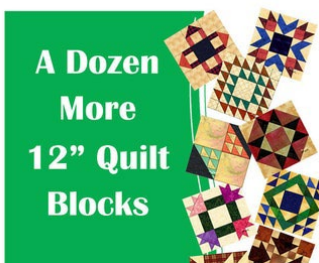
A Dozen MORE 12" Quilt Block Patterns