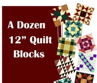
A Dozen 12" Quilt Block Patterns

These are the booklets to purchase and download and print at a low cost to you: